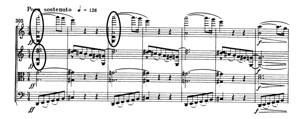
Béla Bartók, Quartet No. 1, 2nd mvt., bars 305-311.