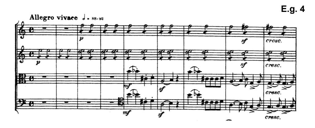
Béla Bartók, Quartet No. 1, 3rd Mvt., section A, bars 1-9.

This paves the transition, without pause, to the third movement. Allegro vivace starts briskly with the obsessive repetition of a note, then turns into the D-E-F cluster followed, from bar 5 onwards, by a thematic motif played by the low strings, which will be frequently repeated and varied throughout the movement, serving as leitmotif.