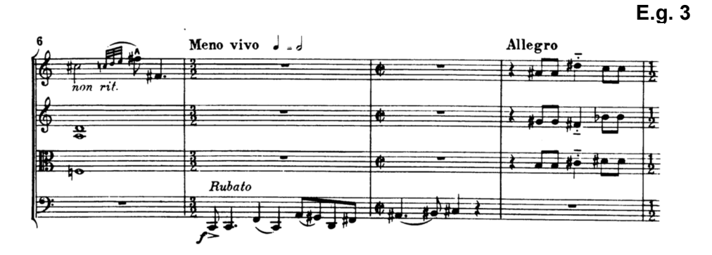
Béla Bartók, Quartet No. 1, Introduzione, bars 7-10

This paves the transition, without pause, to the third movement. Allegro vivace starts briskly with the obsessive repetition of a note, then turns into the D-E-F cluster followed, from bar 5 onwards, by a thematic motif played by the low strings, which will be frequently repeated and varied throughout the movement, serving as leitmotif.