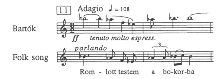
Béla Bartók, Quartet No. 1 , 3<sup>rd</sup> mvt., and the song Romlott testem a bokorba transcribed by Bartók

All the melodic lines that are founded upon certain folk characteristics, specific turns and morphological elements are composed in <u>popular style</u>. These elements can be found in: