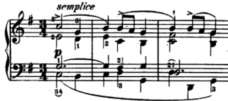
Fr. Chopin, Andante spianato , Op. 22, bars 67 to 69

Apart from the simplicity and clarity of writing in Andante spianato , The Grand Polonaise is remarkable through the melodic, rhythmic and thematic complexness, and the virtuosity elements are everywhere. The composition advances a different sounding perspective: the piano, Chopin's much endeared instrument, has the immense force to rule over the entire orchestral apparatus.