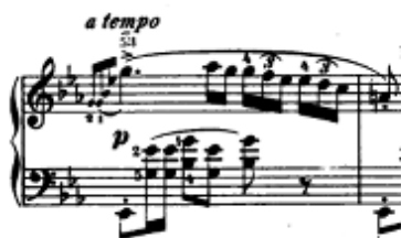
Fr. Chopin, Grande Polonaise , Op. 22, bar 161 (Piano)

Chopin's genre is fully visible during his Parisian period in his maturity creations. He writes an introduction for his Polonaise , Op. 22, a distinct section for piano solo, different in style and expressivity and titles it Andante spianato . Exceptional as style and poetics, Andante spianato in G Major , bearing the agogic indication tranquillo , is a completion of The Polonaise , as the composer himself considers it. Andante spianato is an example of craft and originality in the treatment of musical forms and genres, revealing a romantic feature – a harmonious combination of the lyric, folklore and piano idioms, unveiling the syncretism of arts. The composer is, at the same time, a poet-musician and a Copernic of the piano 31 .