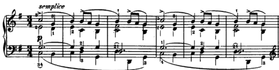
Fr. Chopin, Andante spianato , Op. 22, bars 67 to 72

Section B is composed of two periods, B B 1 , having the following structure: