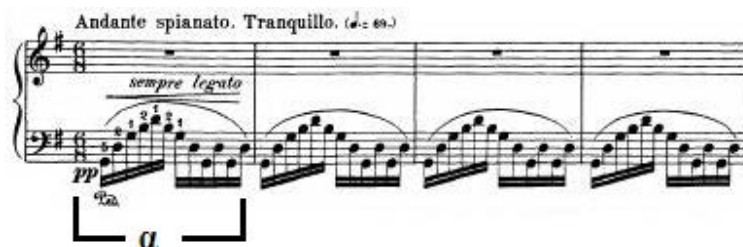
Fr. Chopin, Andante spianato, Op. 22, bars 1 to 4

The first section is composed of three periods, each having two-phrases, as in Table 1 below: