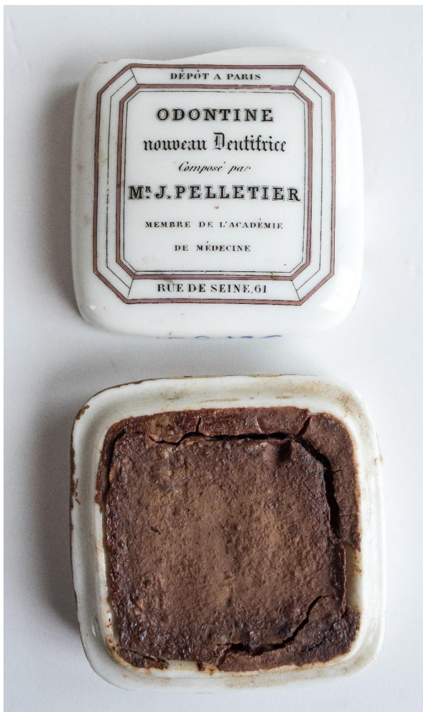
Fig. 5. Porcelain box for dentifrice, with preserved content, made in Paris (cat. no. 58).