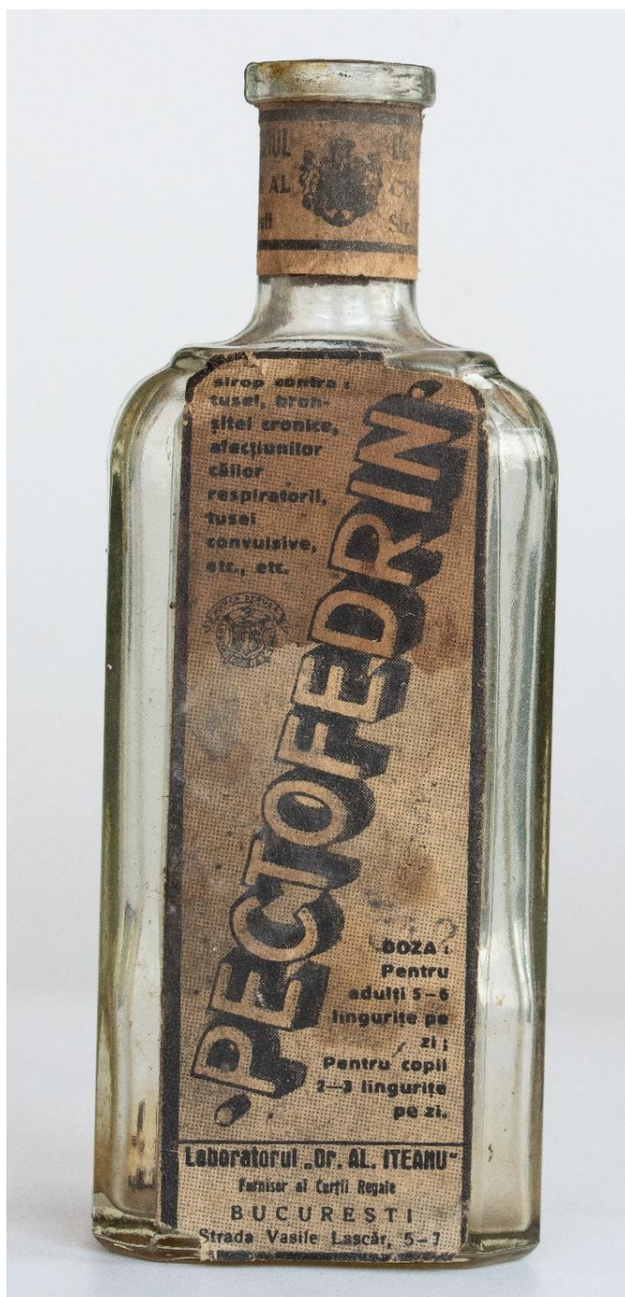
Fig. 4. Clear glass bottle labeled Pectophedrin, produced in Romania (cat. no. 47).