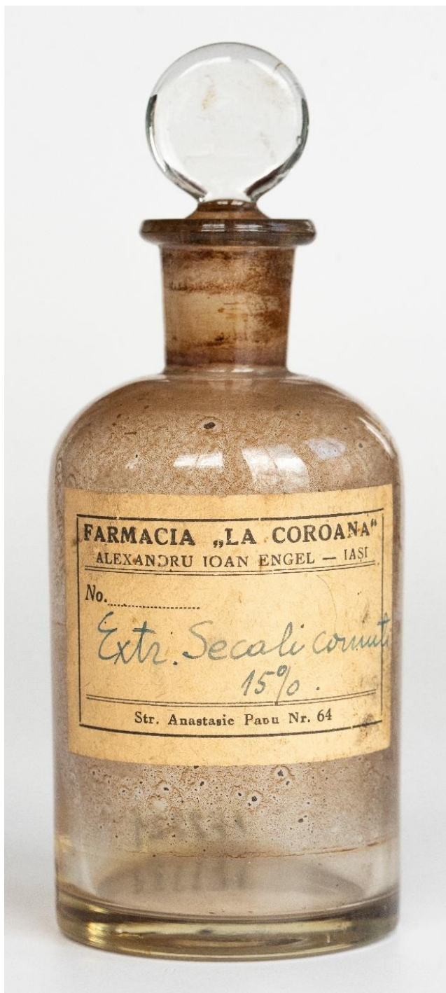
Fig. 3. Clear glass bottle with the label of the "La Coroana" Alexandru Ioan Engel pharmacy (cat. no. 43).