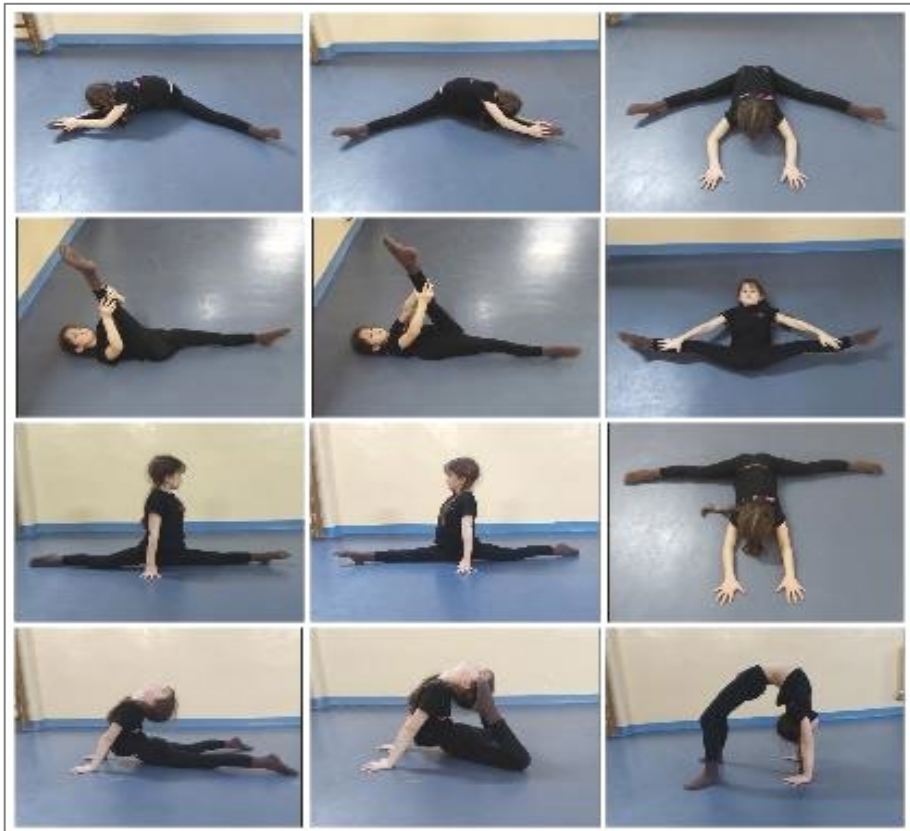
Figure 1. Stretching exercises

Following that, during the first training session of the week (T1) some static ballet drills and artistic jumps were practised, while during the second session (T2) some acrobatic elements were performed. At the end of each session a game for body recovery after effort was played and three minutes of relaxing stretching on music with a very low rhythm followed.