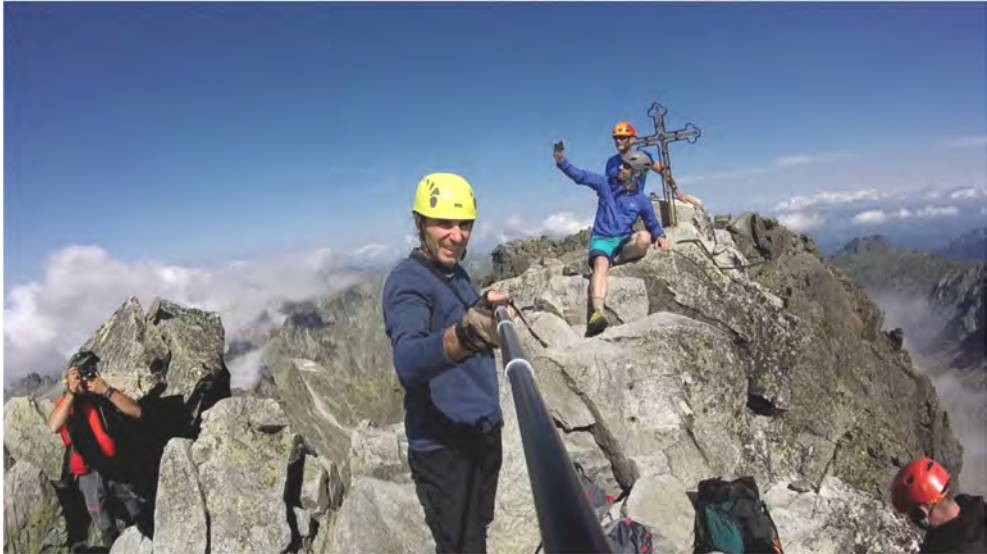
Fig. 5. Gerlachovsky summit

In the process of displacement they were committed fingers, hands and feet in order to facilitate vertical and lateral movement and to ensuring stability and balance to the body. Therefore, techniques have been applied differently according to the micro-relief and slope, as follows: