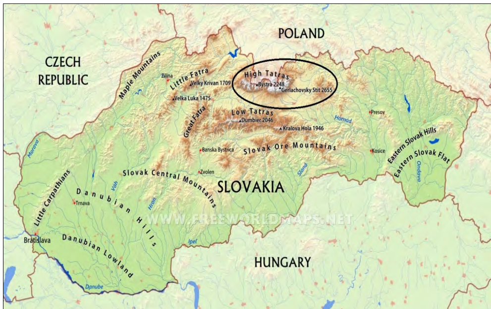
Fig. 2. Study area: High Tatras in Slovakia

At the base of High Tatras massif, between 1000-1500 m, runs Tatra Piedmont, built from glacial materials in the form of long and large summits coated of forest that, is lost in the valley of Poprad. Gerlachovský Peak, which is the subject of this case study, is a secondary summit located between Velička Dolina and Batizovská Dolina, being oriented NW-SE. The front of these summit is marked by a tremendous glacial basin (Gerlachovský kotol), opened to the Tatras Piedmont (fig. 3).