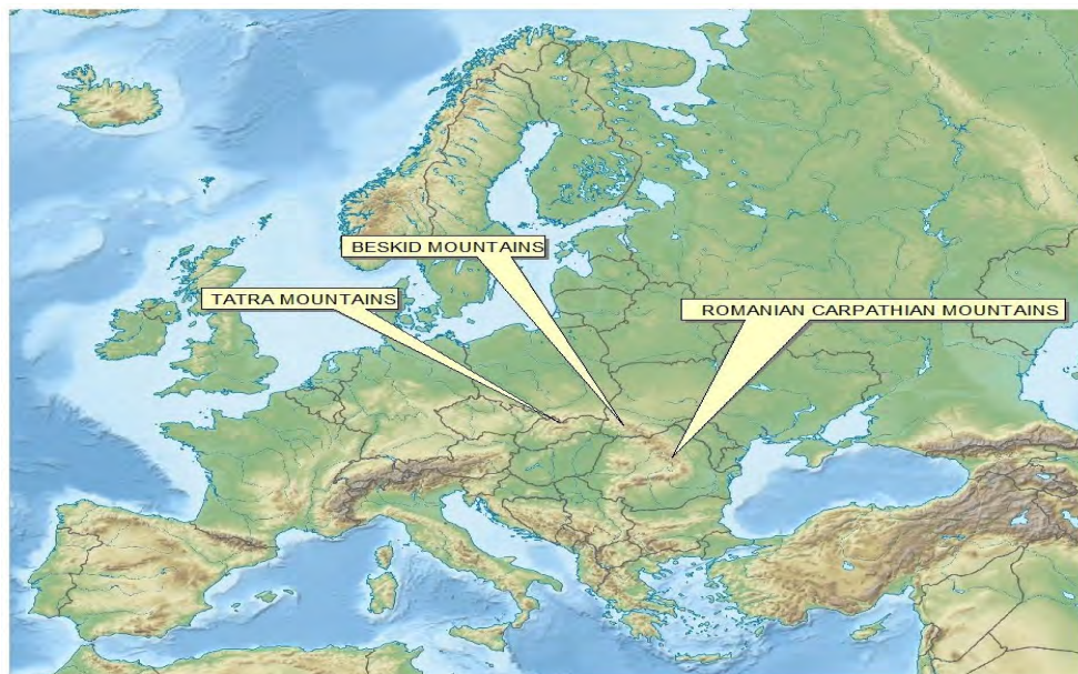
Fig.1. The major subunits of Carpathian Chain