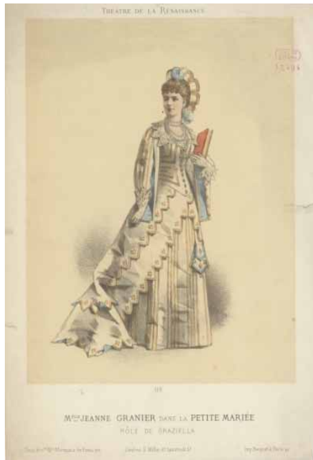
Fig. 6: Jeanne Granier in La petite mariée 14