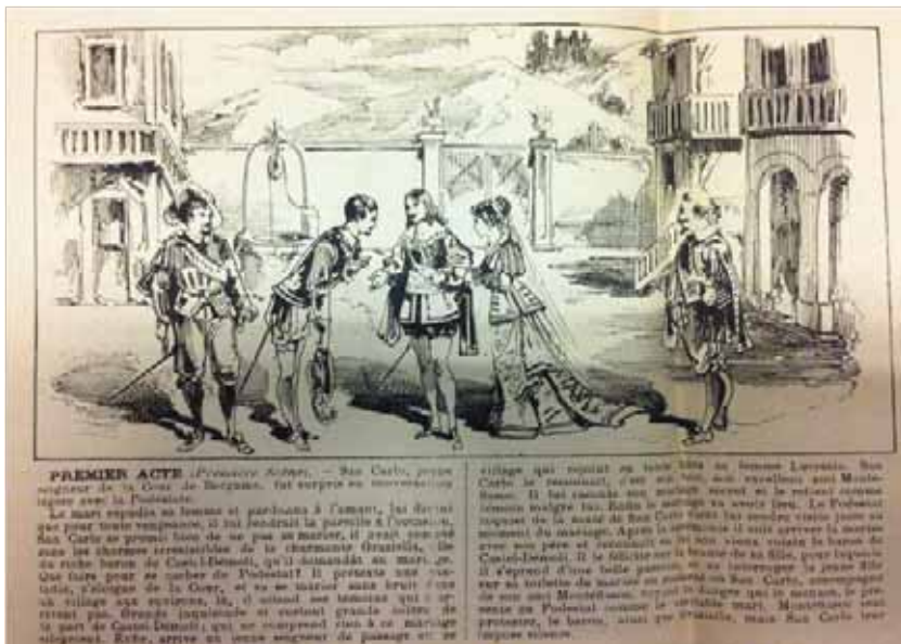
Fig. 3: Illustrated abstract of La Petite Mariée 12

Despite the starting point being that simple, all the other happenings fill several pages with discussions, misunderstandings, hidings, escapes, etc. In a newspaper of the time was also published an illustrated abstract of the tale. This kind of publication would, at the same time, be a good advertisement for the show and help the audience understand the happenings from the beginning to the end. The feature presents two drawings for each act, with the description below it: