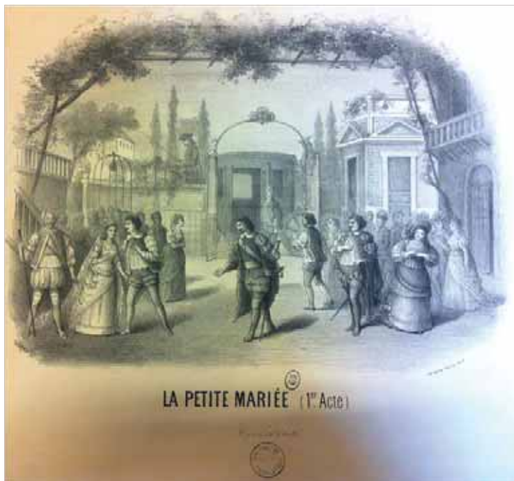
Fig 4: Sketch of the first act of La petite mariée

Besides the drawing with the abstract, published in the newspaper, there are some other sketches of the scene dated 1875. In the newspaper, the aim was to reproduce the plot, with some imagination of the scenery, even though the costumes are very alike the real ones. The drawings below have the objective of registering the theater scene, not the fiction, but the scenery and the actors.