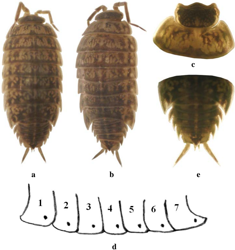
Figure 1. Orthometopon romanicus nov. spec., Holotyp, male and female dorsal view: a. ♂ 6.5 x 3 mm, b. ♀ 8.2 x 3.5 mm, c. cephalic lobes, d. coxal plates of the pereion and noduli laterales, e. pleon.