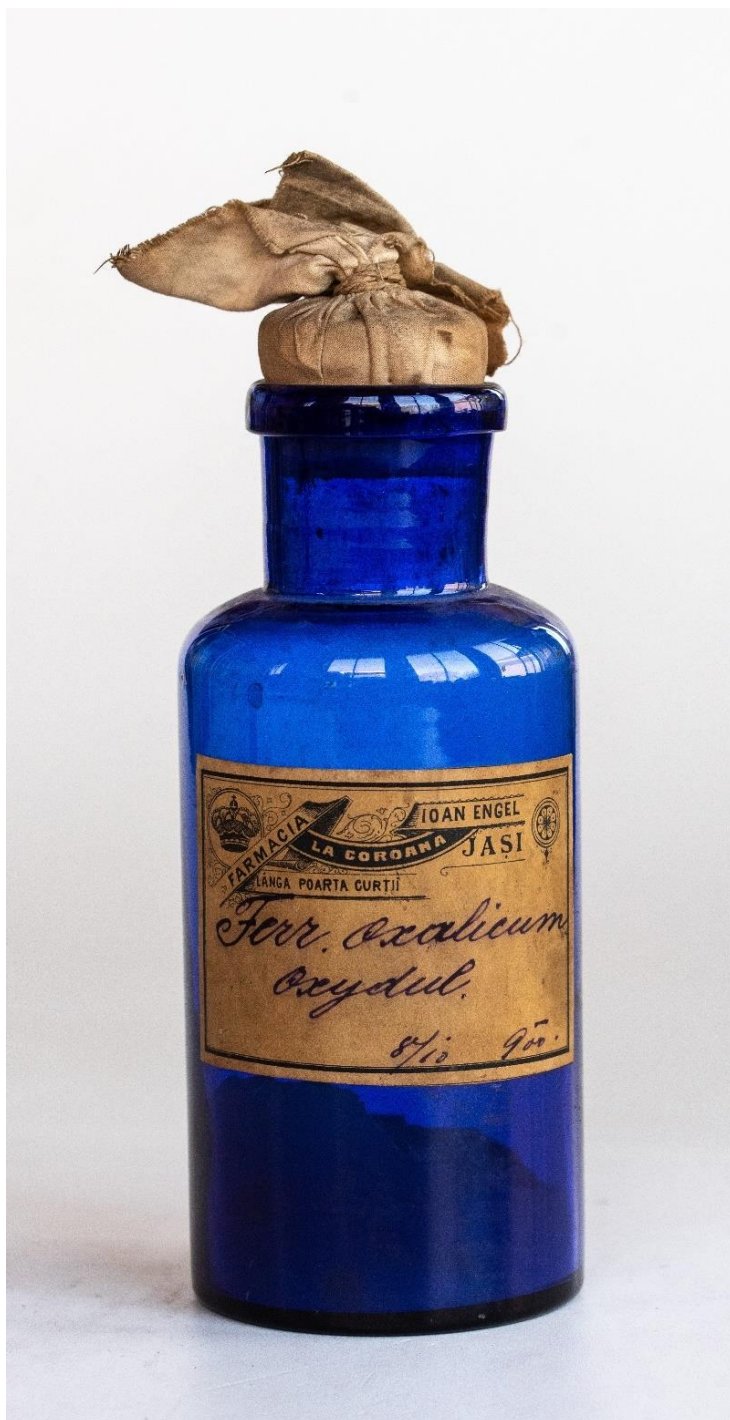
Fig. 2. Blue glass bottle with the label of the “La Coróna” Ioan Engel pharmacy (cat. no. 15).