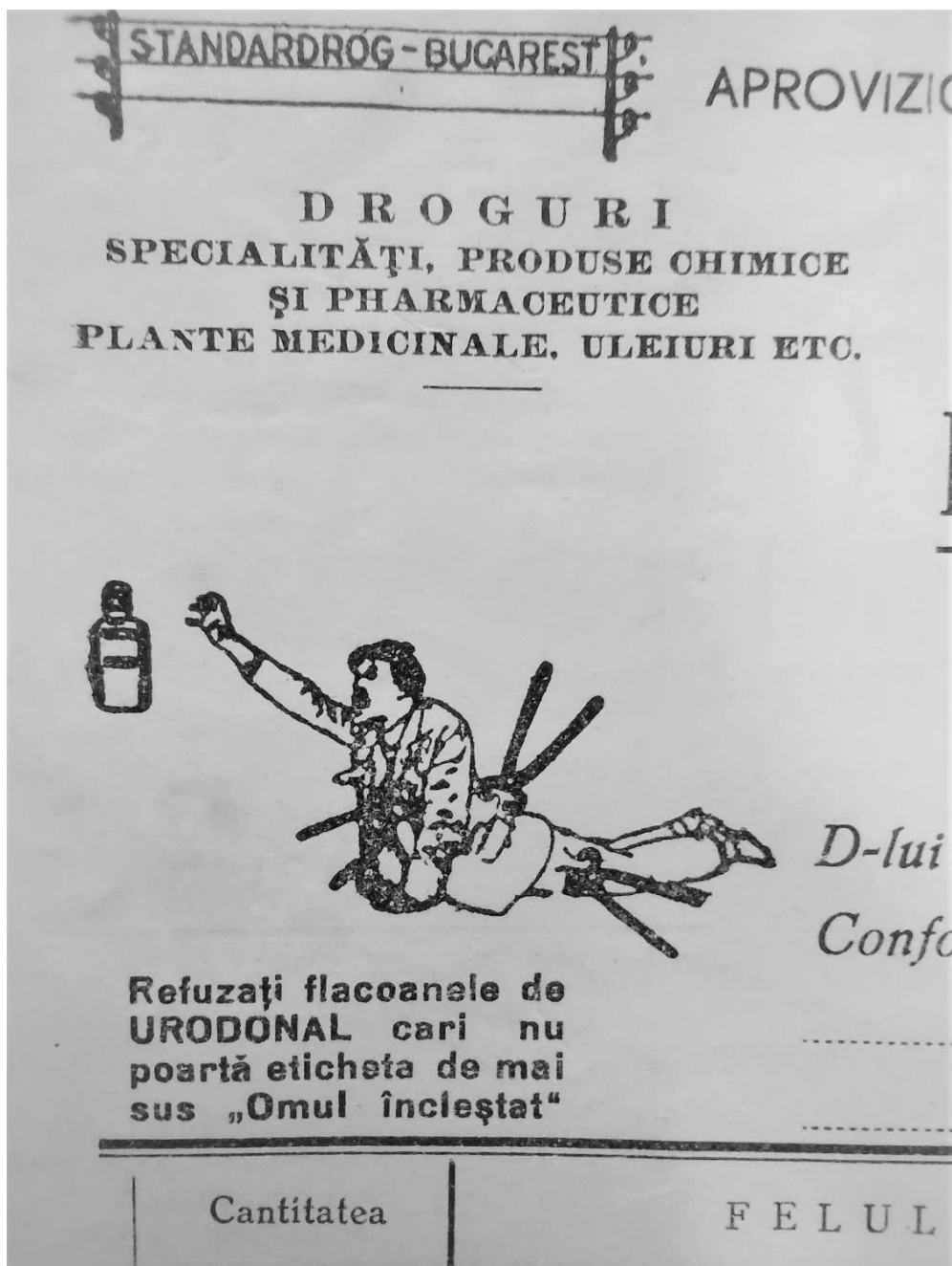
Fig. 6. Commercial for Urodonal on a bill issued by Standardrog (cat. no. 76).